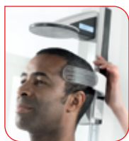
Exact measurement results are guaranteed by precise positioning of the head made possible with the seca Frankfurt Line.