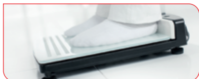
The stable glass platform of the seca 274 with integrated heel positioner guarantees precise measurements and firm and safe footing.

It's all the same if you decide in favor of the wall-installed seca 264 or the free-standing seca 274 because both provide precise height measurement to the millimeter. Noteworthy features include the three-part measuring rod of high-quality aluminum and the robust headpiece, which glides smoothly along the rod. All the while the patient stands safe and secure – even with wet feet.