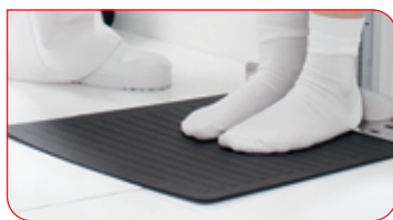
Patients can stand comfortably on the rubber mat of the seca 264 while the heel positioner makes sure those bare feet are in the right place on the platform.