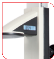
The white backlit display on the headpiece is very easy to read.