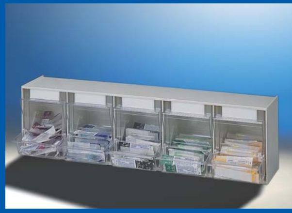
PicBox® syringe dispenser ▶ ref.no.: 11369