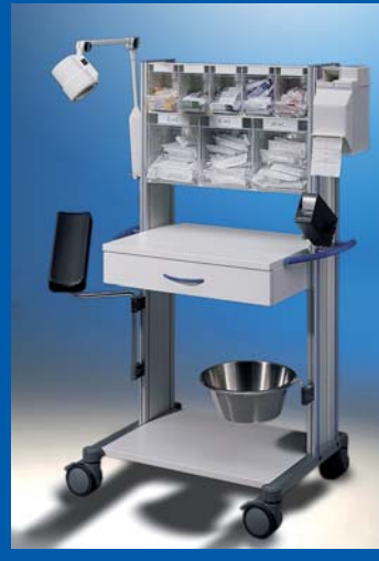
swingo® PicBox® Plus injection trolley (without lamp) ref.no.: 13322

A practical workstation for taking blood samples and administering injections – just one example of many mobile workstations in the HAEBERLE range.