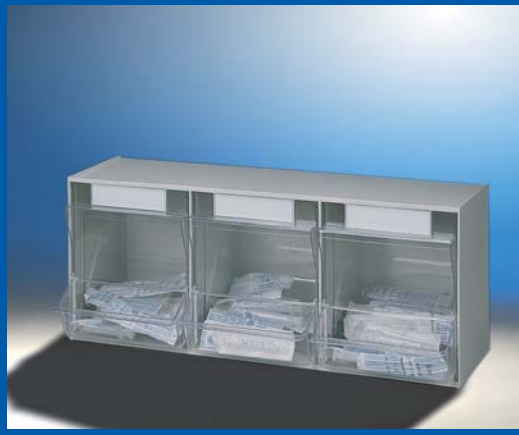
PicBox® cannula dispenser ref.no.: 11368

Cannula and syringe dispenser. Dim.: 600 x 200 x 410 mm (w x d x h) ref.no.: 11384