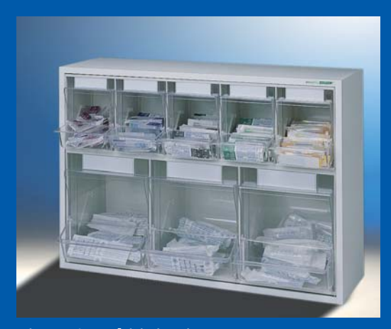
PicBox® Multi injection Set

Cannula and syringe dispenser in an elegant, white plastic veneered housing.