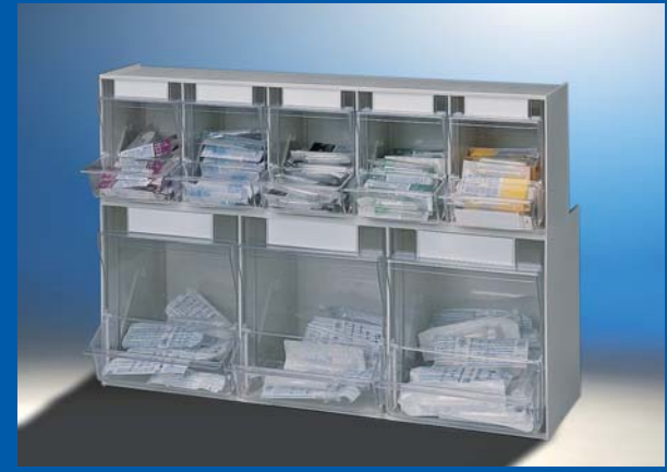
PicBox® injection Set

Cannula and syringe dispenser. Dim.: 600 x 200 x 410 mm (w x d x h) ref.no.: 11384