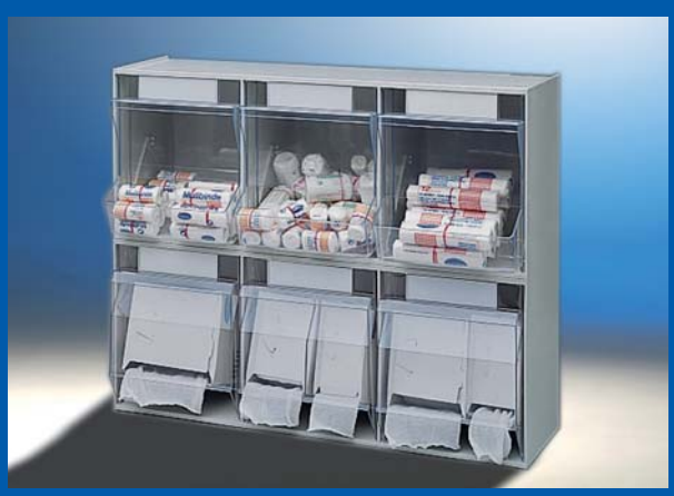
PicBox® dressing dispenser Set

A practical combination for gauze and tubular dressings.