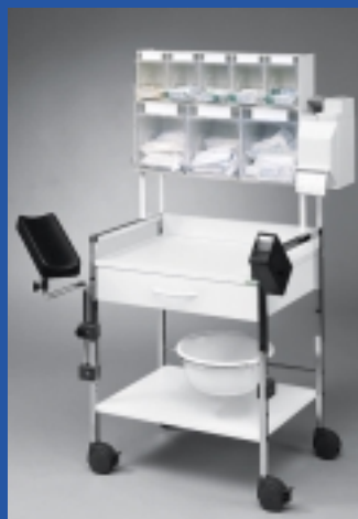
Variocar®60, Injection trolley PicBox®Plus, ■ ref.no 10547 white