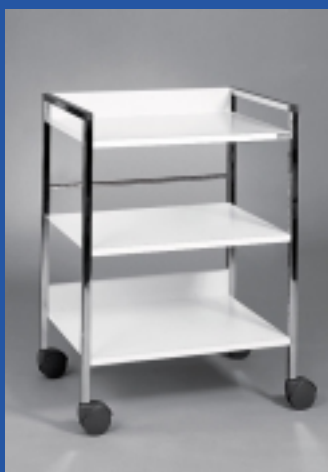
Variocar®60, with 3 shelves • ref.no 05622 white