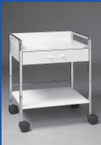
Variocar® 60 Basic trolley with 1 drawer, • ref.no 08069 white