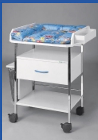
Variocar®60, Nursing trolley for rooming-in ■ ref.no 14834 white