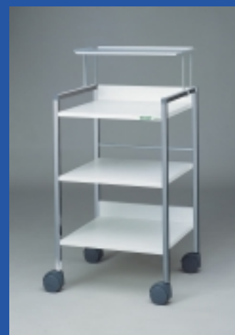
Variocar®45, Equipment tower ■ ref.no 14435