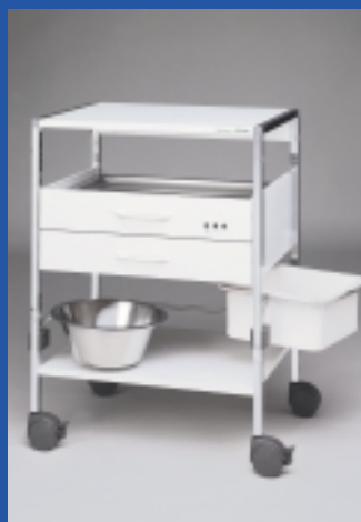
Variocar®60, Trolley for gynaecology ■ ref.no 05438 white