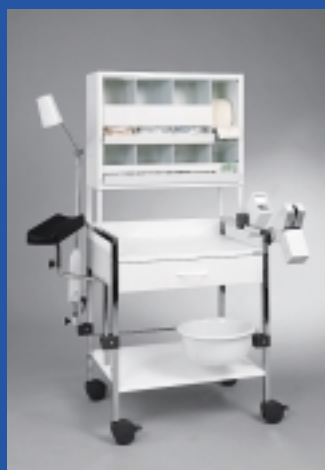
Variocar®60, Injection trolley COMPACT ■ ref.no 05428 white