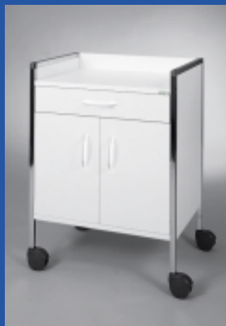
Variocar®60, Cabinet trolley • ref.no 04723 white