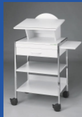
Variocar®60, Writing desk ■ ref.no 15584 white