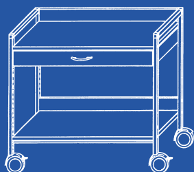
Variocar®90, Basic trolley with 1 drawer • ref.no 04511

height: 73, 83 or 53 cm width: 45, 60 or 90 cm