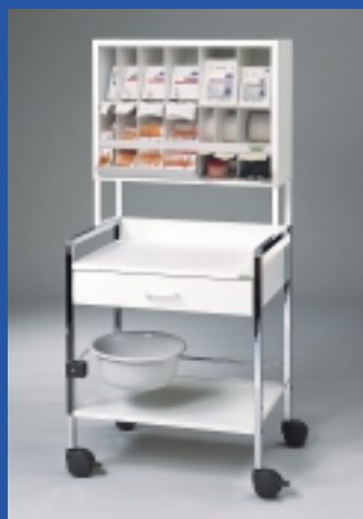
Variocar®60, Treatment trolley COMPACT ■ ref.no 05433 white