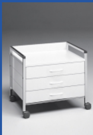
Variocar®60, Underneath trolley • ref.no 08054 white