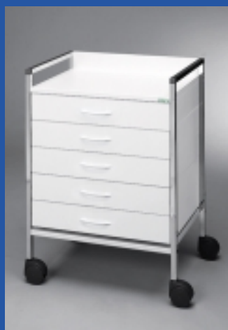
Variocar®60, Basic trolley with 5 drawers, • ref.no 08096 white