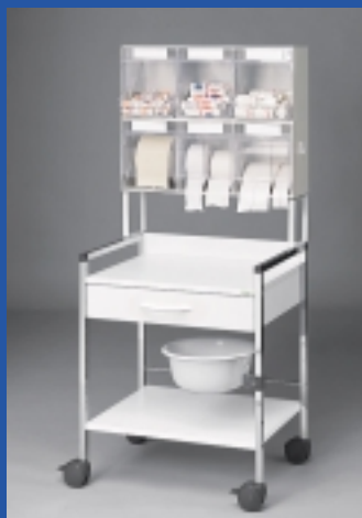
Variocar®60, Treatment trolley PicBox®, ■ ref.no 12477 white

Lamps are not part of the basic combination. Please ask for our special lamp prospect.