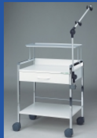
Variocar®60, Ergometry trolley ■ ref.no 05443 white