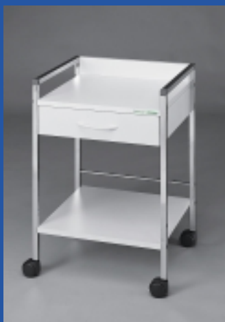
Variocar®45, white with 1 drawer • ref.no 15609 Additional drawer • ref.no 15610