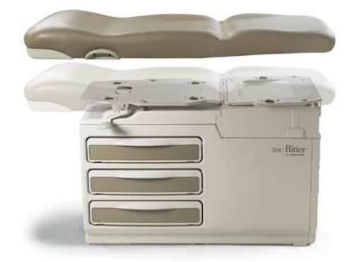
Removable Top System - The one-piece, upholstered top can be easily removed without tools, allowing a thorough cleaning or a quick upholstery color change.