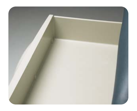
One-Piece Seamless Drawers One-piece seamless drawers have easy-toclean rounded edges and are designed to contain spilled fluids, keeping them from other areas of the table, thereby improving infection control.

The result of this research? The Ritter 204 Manual Exam Table . Featuring the latest in design, comfort and functionality in a manual exam table, it truly offers efficient patient care.