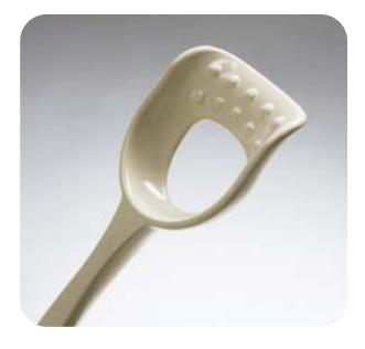
Comfort designed stirrups help make the lithotomy position a little easier for your patients.

Steel Reinforced Seat to support patient in seated position (prevents seat deflection and future breakage).