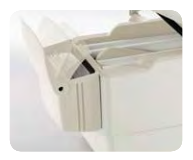
Storage needs - Ritter Barrier-Free tables provide space for up to four paper rolls. An optional rear storage pod provides extra room for supplies, such as disposable gowns and drapes.

Box-style exam tables have been the industry standard in exam rooms for over 50 years, however they are inaccessable, uncomfortable and inefficient. The choice is clear... the Ritter Barrier-Free tables are the new industry standard with powered height and features that are functional and efficient... so why settle for anything less in your practice? The Ritter 222 & 223 Barrier-Free Power Examination Tables are everything you could ask for, at a price you can afford.