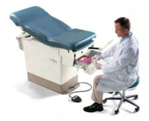
Ritter 222 High-Low Power Examination Table