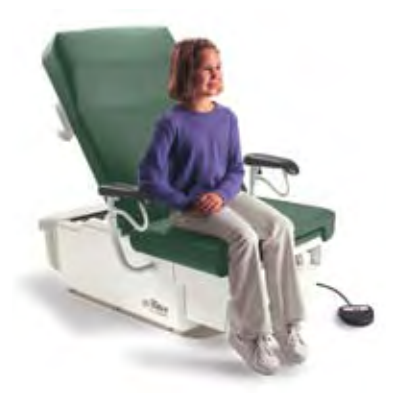
The Ritter 222 & 223's unique arm system accessory gives your patients a stable platform to assist them in getting onto the table.

With unprecedented low and high positioning heights, the Ritter 222 has a gas spring assisted back section with an easy access backrest mechanism, while the Ritter 223 has a power back system. Both have builtin pillow, hideaway stirrups that lock in one of four lateral positions, foot extension shelf to expand the table length, paper roll holder hidden under headrest, storage for four 21"x 3.5" diameter paper rolls, polystyrene treatment pan, foot control, Exam Assistant Drawer System<sup>™</sup> and leveling screws