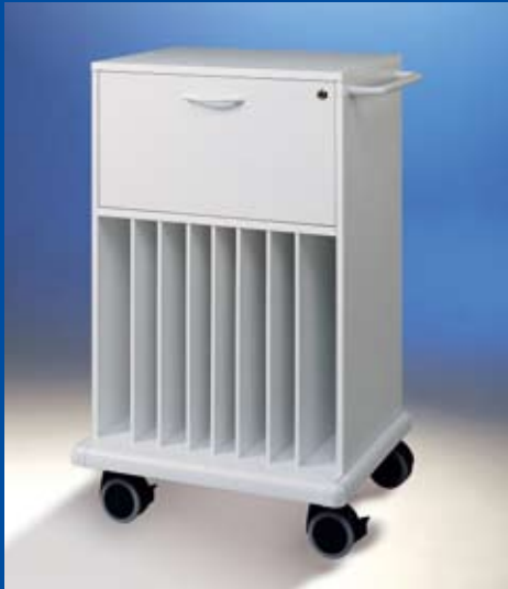
Hospicar ® Round trolley 3 ref.no. 14178