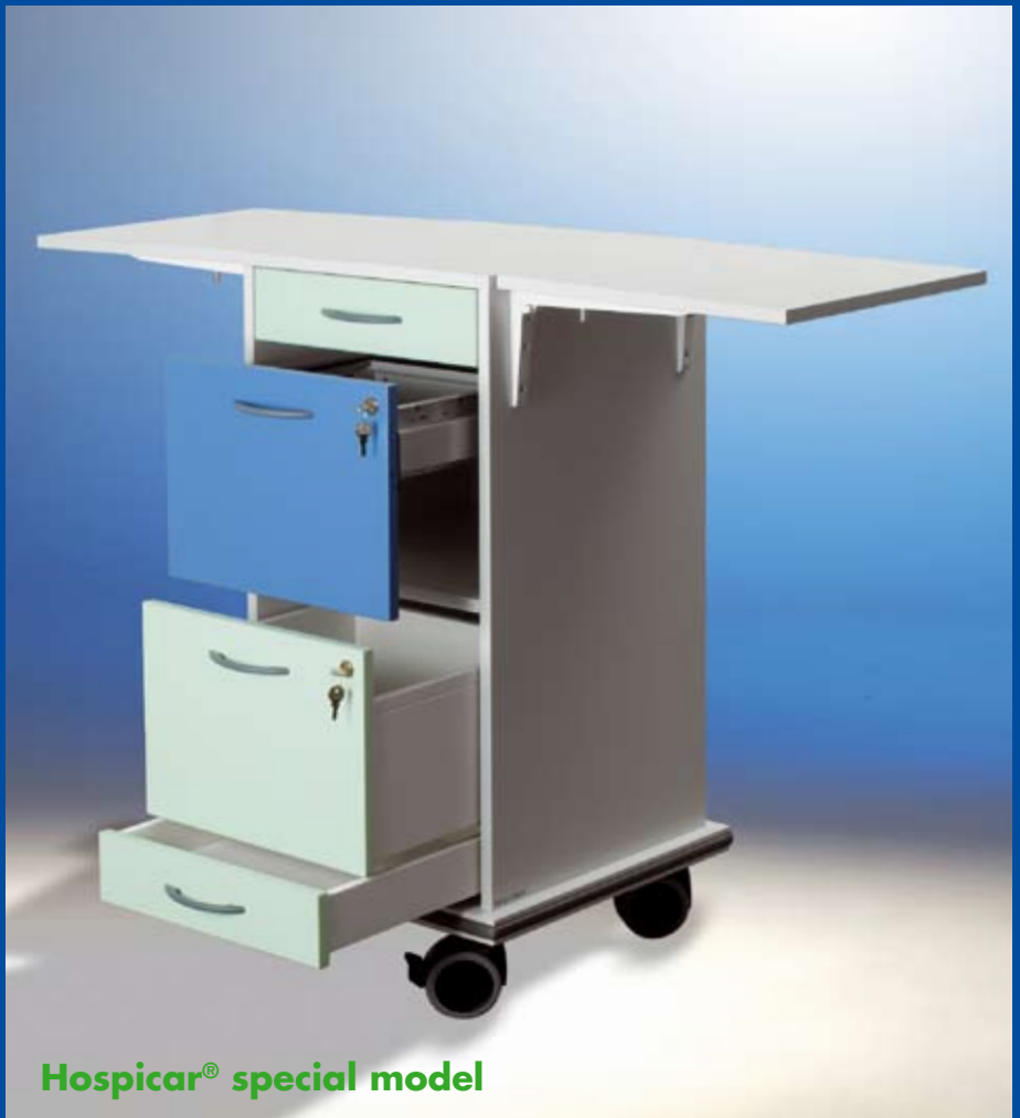
Hospicar® special model

You also have the full choice of our range of materials and finishes. Please contact us!