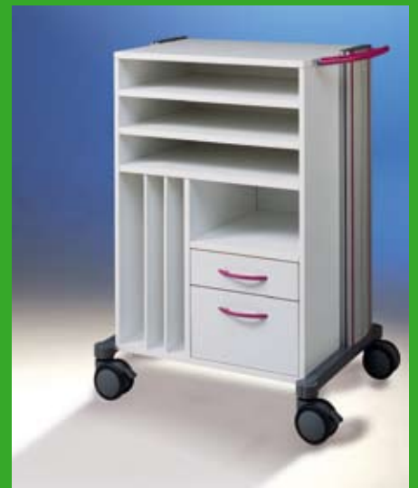
swingo ® -visit Round trolley 2 ref.no. 1356. + colour number