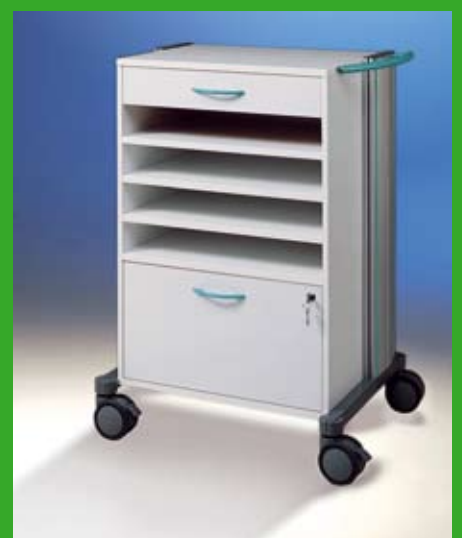
swingo ® -visit Round trolley 4 ref.no. 1357 + colour number