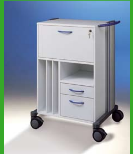
swingo ® -visit Round trolley 1 ref.no. 1355. + colour number