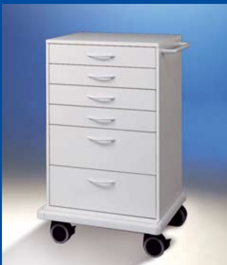
Hospicar ® Medicine trolley ref.no. 14181