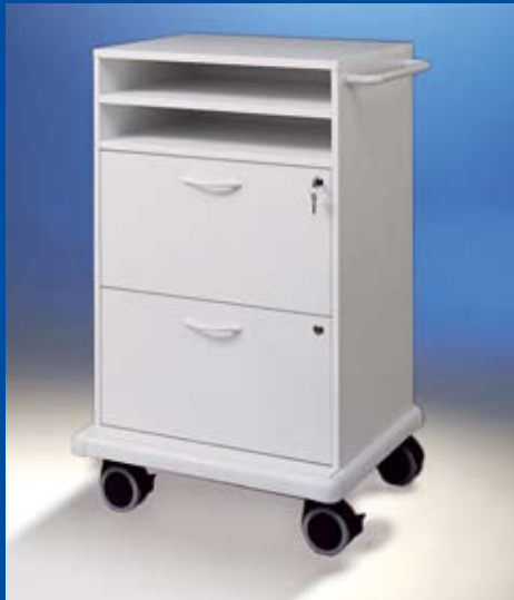
Hospicar ® Round trolley 5 ref.no. 14180